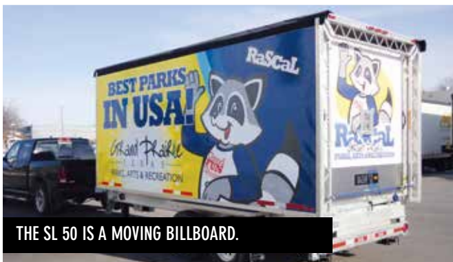
THE SL 50 IS A MOVING BILLBOARD.

Smooth rivet-free panels with gel coat that improve graphic application and appearance.